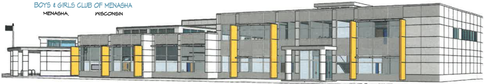
A BUILDING ADDITION FOR: BOYS & GIRLS CLUB OF MENASHA MENASHA, WISCONSIN

57% of club alumni say Club saved their life!