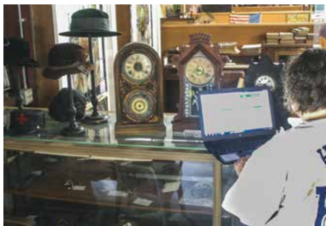
Grant dollars helped the Calumet County Historical Society Museum preserve history with new collection management software.

Since its humble beginning, the Chilton Area Community Foundation has done, and will continue to do, great things for the Chilton area, touching the lives of you, your neighbors, your children, grandchildren and generations to come. Together, lets continue to make a difference!